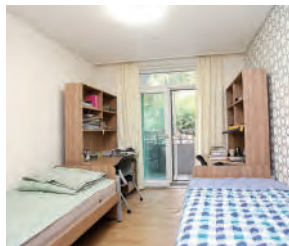
2 person Room