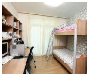
2 person Room