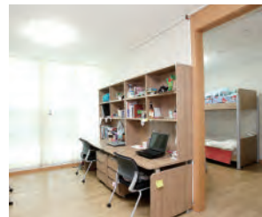
4 person Room