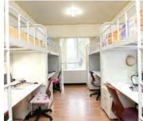
4 person Room