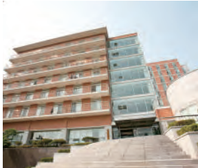
Baekyang Living Hall

Silla University has two dormitories which are 'Baekyang living hall'(1st dormitory) and 'Global town' (2nd dormitory).