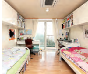
2 person Room